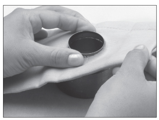
4. Place pierced fabric over male grommet facing forward.