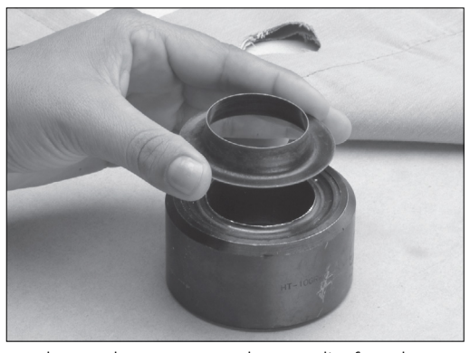
3. Place male grommet on bottom die, face down.