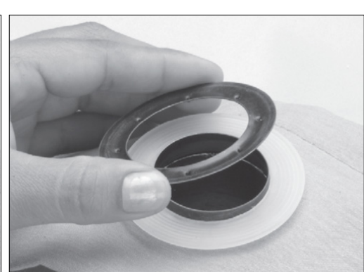
When installing grommets on lighter fabrics use DXG90012 Fabric Support Ring between female grommet and fabric.

t 847.247.0100 f 847.247.9270 brimar@brimarinc.com brimarinc.com