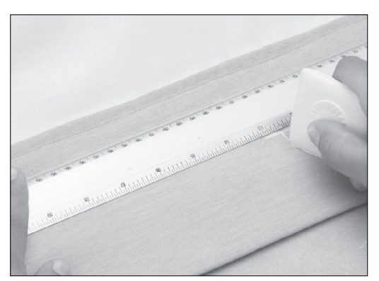
1. Calculate and mark the grommet locations according to your design specifications.