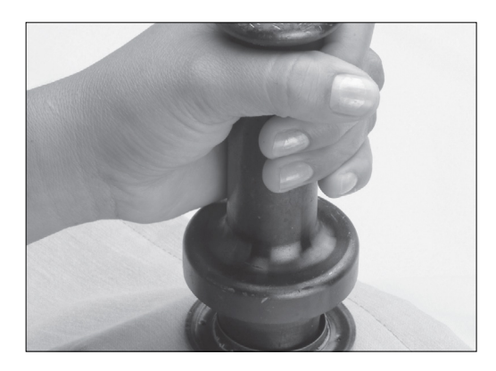
6. Place die set handle in position.