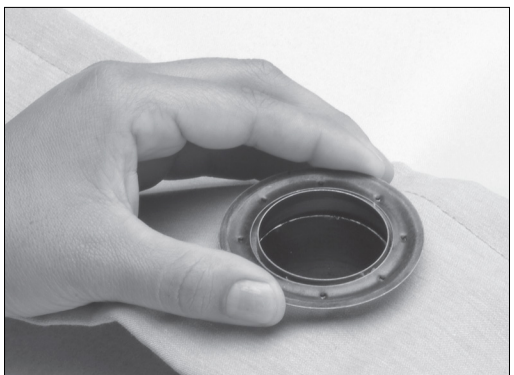
5. \ \ {\it Place female grommet over fabric teeth down}.