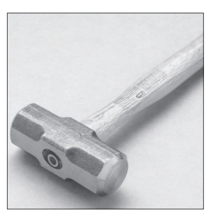
4 Pound Sledge Hammer