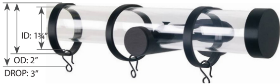
METAL RING 1/4" THICKNESS DTI30