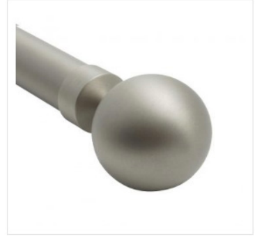
FIFTH AVENUE ⓘ