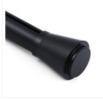
PARK AVENUE ⓘ