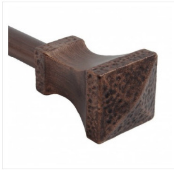
SIGNATURE METAL ⓘ