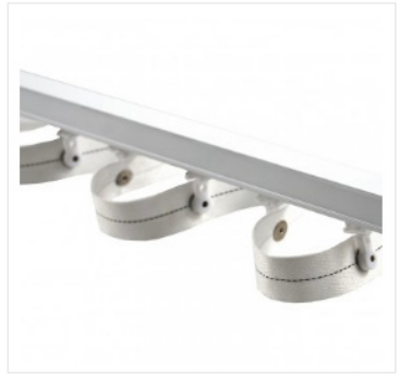
CS TRACKS ⓘ