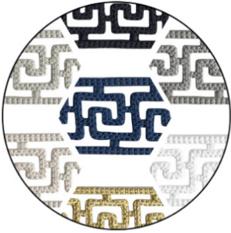
Grecian Treasure GREEK KEY COLLECTION