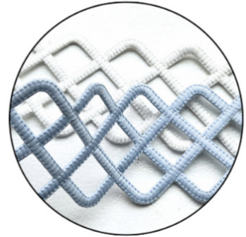
Timeless Fretwork FRETIQUE COLLECTION